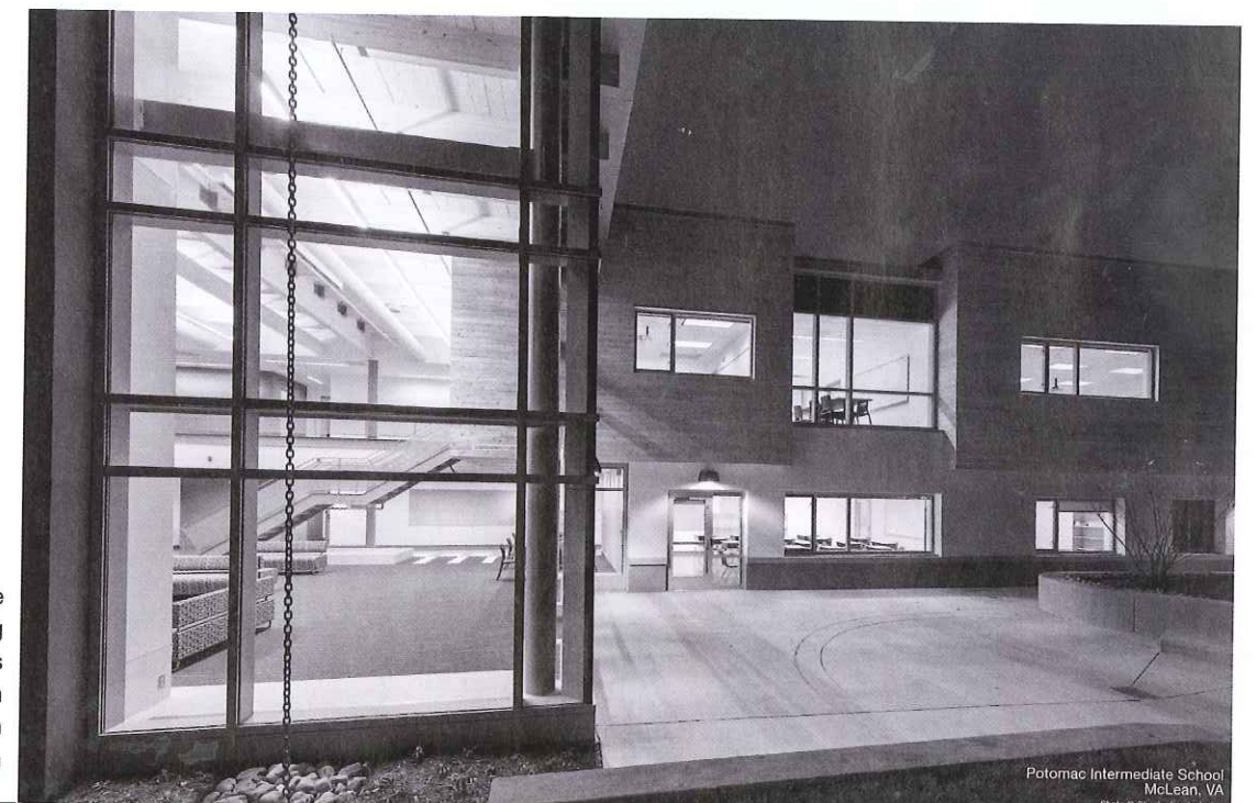
Potomac Intermediate School McLean, VA

architecture master planning feasibility studies interior design historic preservation sustainable design